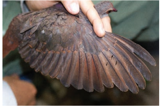
Figure 5. Adult male Violaceous Quail-Dove Geotrygon violacea , Amazon Research and Conservation Center, Madre de Dios, Peru, July 2012 (Tom Ambrose)