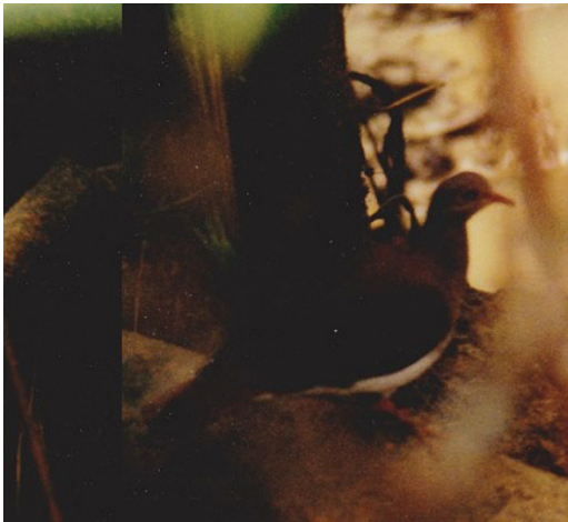
Figure 3. Adult male Violeous Quail-Dove Geotrygon violacea , Manu Wildlife Center, Madre de Dios, Peru, early 2000 (Toa Kyle)