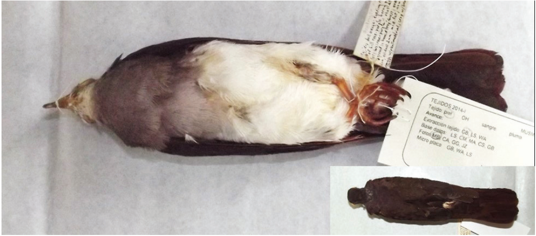
Figure 2. Adult female Violeous Quail-Dove Geotrygon violacea , collected at Cerro Tahuayo, dpto. Ucayali, Peru, July 1987 (MUSM 15394) (Alexis Díaz)