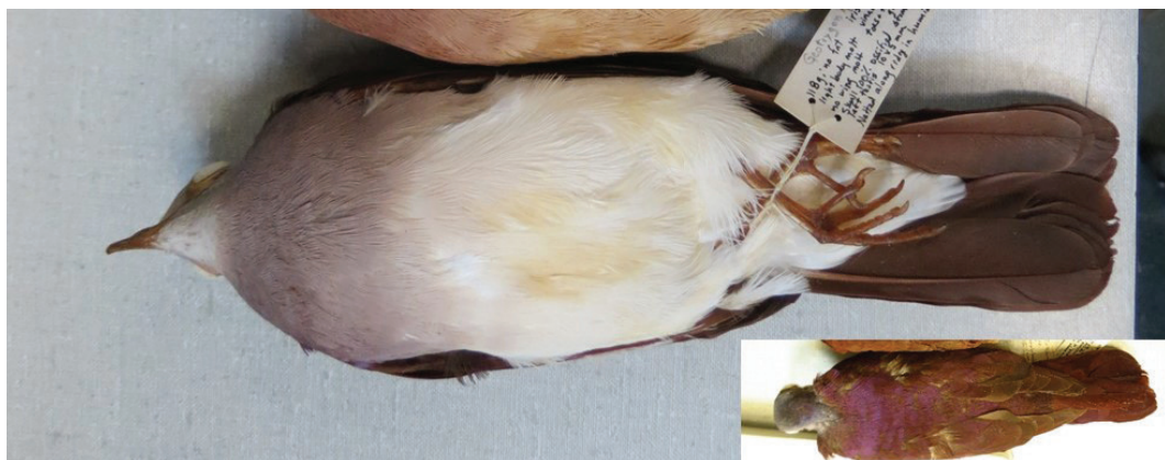
Figure 1. Adult male Violaceous Quail-Dove Geotrygon violacea , collected at Cerro Tahuayo, dpto. Ucayali, Peru, July 1987 (LSUMZ 156179) (Fernando Angulo)