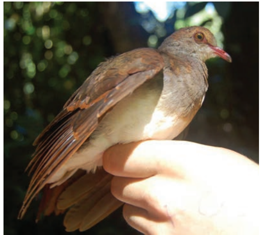
Figure 4. Immature Violeous Quail-Dove Geotrygon violacea , Reserva Ecológica Taricaya, Madre de Dios, Peru, August 2000 (Rachel Kilby)

(12°03'24.26"S 69°31'43.07"W; 265 m). Age and sex was determined by the yellow eyes, whitish forecrown becoming grey on the mid crown and violet feathers on the neck and back. On 25 October 2012, J. Molina, E. Ormaeche & L. Dablin heard a male vocalising and observed it perched. It was identified by the short tail without white tips to the outer rectrices, white underparts, and contrasting brown back and more rufescent rump, uppertail-coverts and tail.